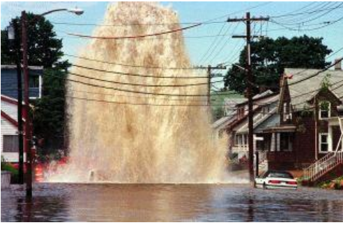
Municipal Projects Accounted For 30% Of The Violations Last Year.