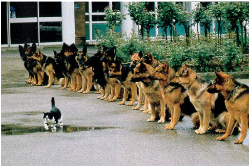
Don't Take Unnecessary Chances