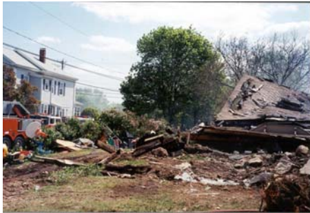
Lack Of Communication Resulted In 25% Of The Violations Last Year.